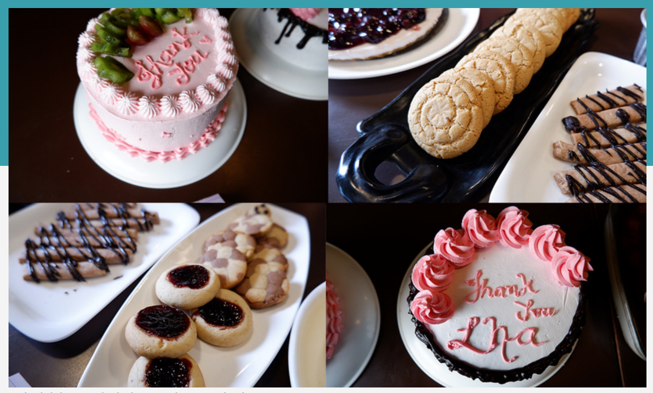
Baked delicacies by bakery students on display

The Livelihood Skill Training Program was 2019 to address the started in unemployment issue in the Tibetan community. For the last three years, we have trained around three hundred Tibetans under various short-term skill courses. In 2023, we were able to train 107 students out of the more than 380 applicants we received. The applicants are carefully filtered and selected based on their educational qualifications, aims and