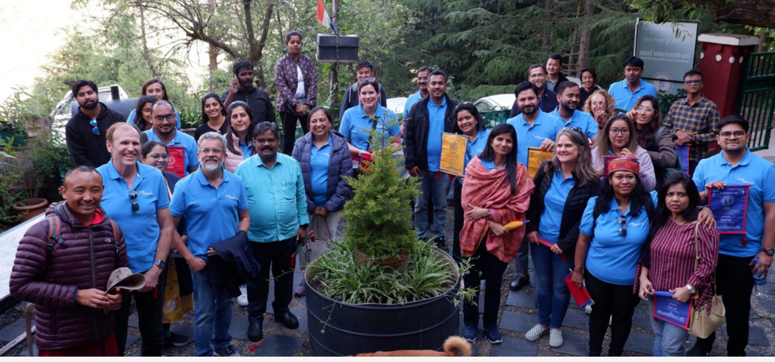
Cultural exchange program participants with their mutual learning partners outside Ahimsa House