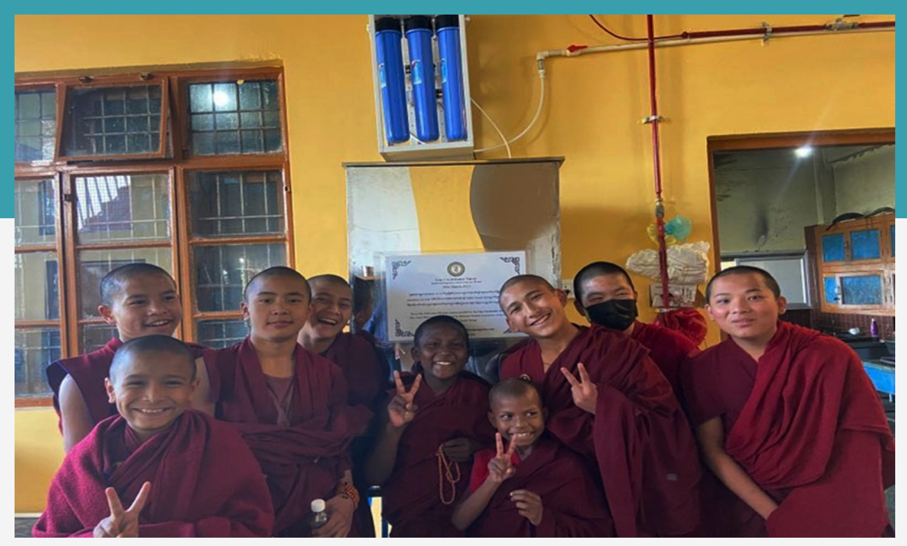
Monks from Kirti Monastery posing for a group photo infront of newly installed water filter