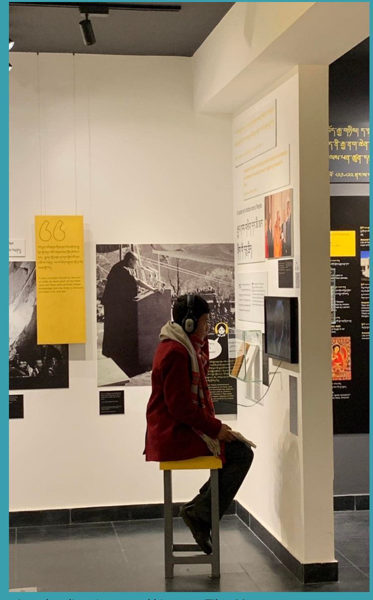
A student listening to oral history at Tibet Museum

Understanding the lack of opportunities to travel and to gain knowledge of Tibetan culture, especially for children from remote settlements, we believe this educational program is of immense potential benefit for our young Tibetans. It was only with financial help from generous individuals and long-time friends of Lha that we were able to implement this program. We hope to be fortunate enough to continue it in the future.