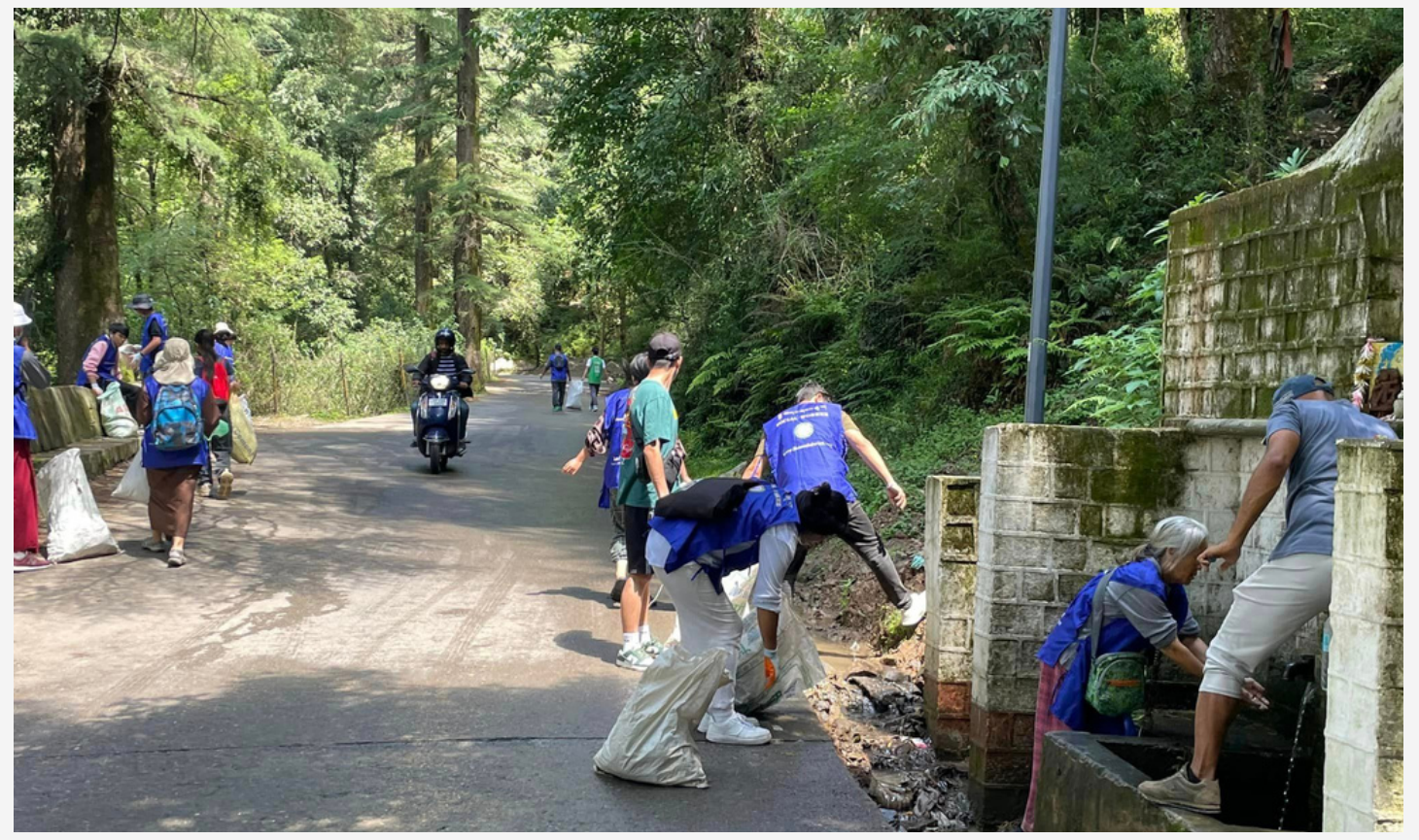
Volunteers and students picking up trash on the roadside