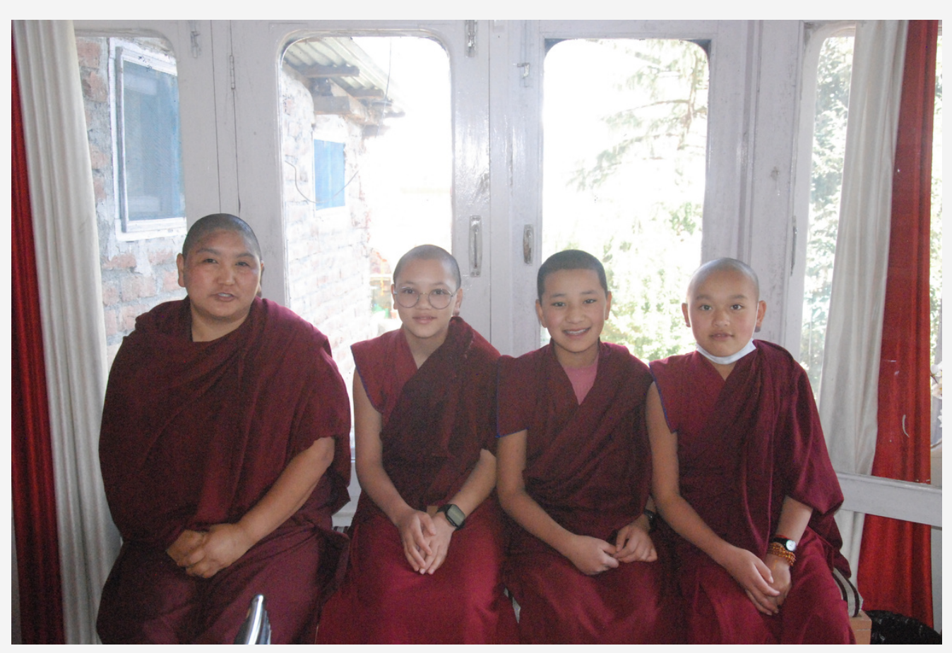
Nuns waiting for their turn to get dental check up

Since 2014, Lha has provided free dental care and eye care services to nuns and monks in the Dharamshala and Bir regions. In 2023, Lha arranged free dental check-ups for 33 nuns, six monks, and seven laypeople for a total of 46 people. They availed themselves of the services; including fillings, extractions, scaling and root canal treatments. We also provided them with bamboo toothbrush to each of them and doctor assisted them the proper ways to brush their teeth. In total, 1,326 Tibetan refugees and Himalayan people have benefitted from the Smile Dental Care Project.