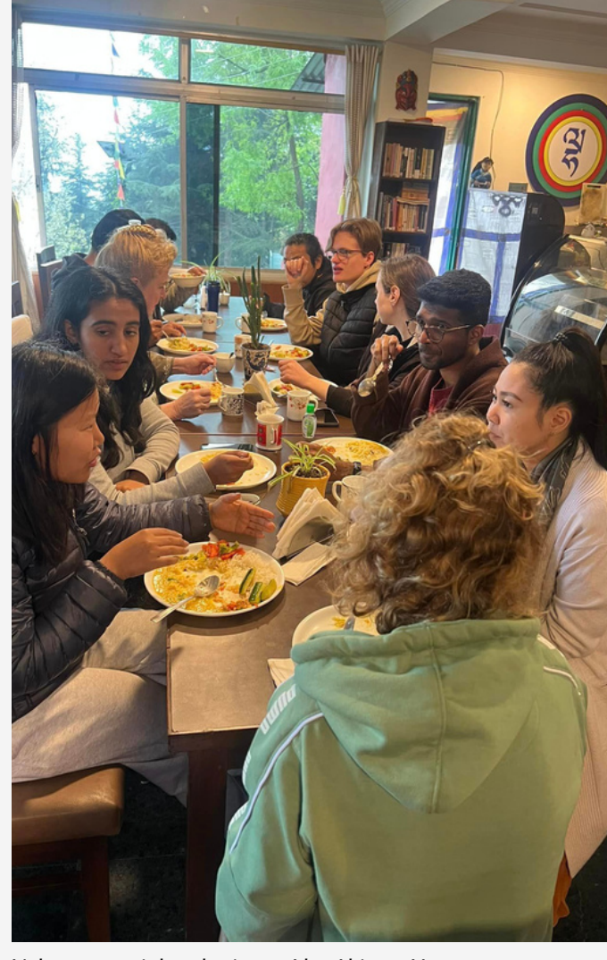
Volunteer social gathering at Lha Ahimsa House

Volunteers are the backbone of Lha, playing a major role in carrying out the day-to-day operation of the programs. The volunteers are offered a platform to explore a new culture and tradition through their direct engagement with the Tibetan Community. In 2023 over 173 volunteers engaged with different activities, bringing the total number of volunteers from around the world for the past 26 years to 8864. Volunteers assist in many projects including story writings, teaching language courses in Tibetan, English, French, and Chinese, providing one-to-one private language tutoring and assisting in our English Conversation Class. We are immensely thankful to our volunteers contributing to Lha and becoming more informed and engaged with the Tibetan Community.